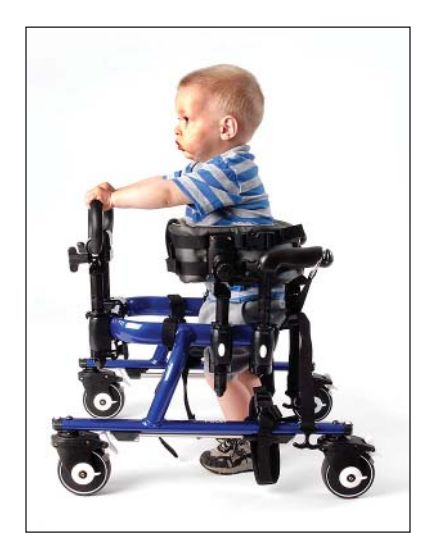
Figure 23b Shows normal positioning. Note that the chest prompt has no tilt and the slightly forward-leaning angle of the user is achieved by locating the hip positioner/pelvic support behind the shoulders.