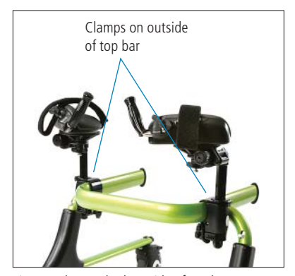
Figure 10b Attached outside of top bar