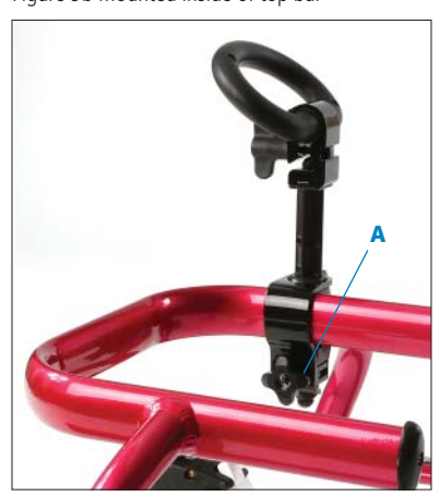
Figure 9c Mounted outside of top bar