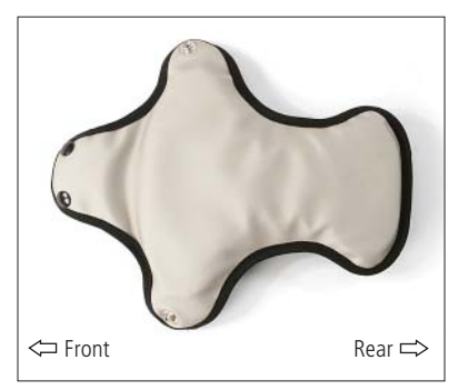
Figure 16a Top of hip pad