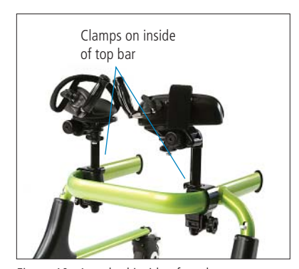
Figure 10c Attached inside of top bar