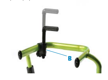
Step 2. Press button (B), lift post out of clamp, and turn to desired position.