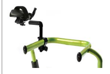
Step 3. Insert post back into clamp, slide arm prompt pad back onto post, and use button (B) to adjust the height of the arm prompt.