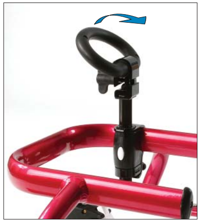
Figure 9b Mounted inside of top bar