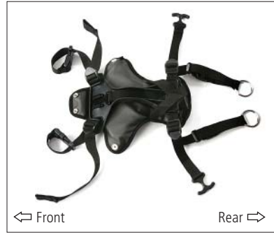
Figure 16c Underside of hip positioner with pad