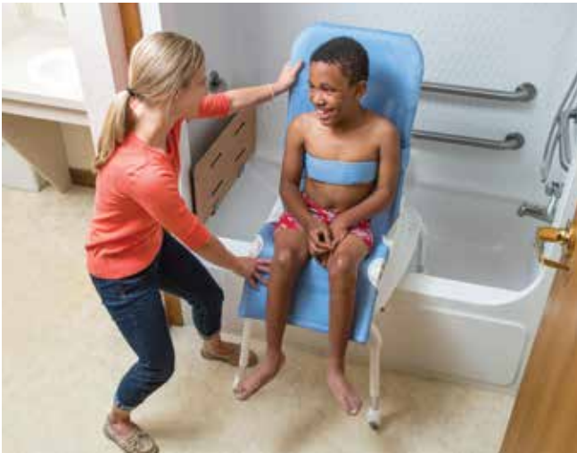
1. With the client secured in the chair, push the transfer base to the back of the tub as far as it will go and lock the wheels.