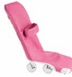
Without calf rest (Z269)