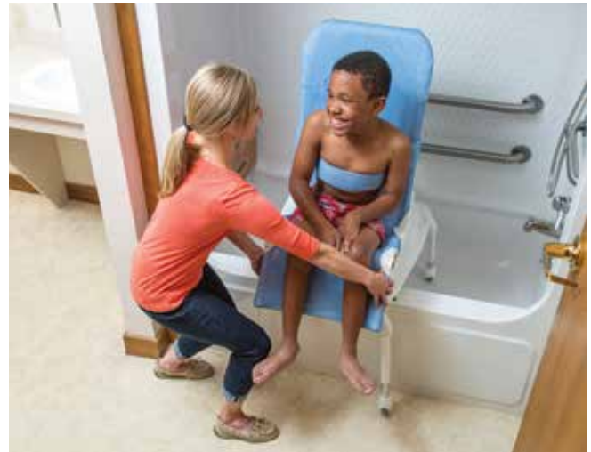
2. Press either of the gray pivot latches on the transfer base and start to rotate the bath chair and client over the tub.