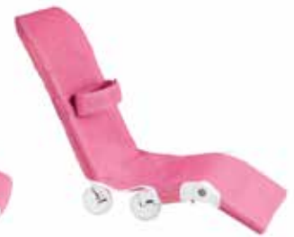
With calf rest (Z267)

Conversion kits are the smart solution for growing children. For a fraction of the cost you can convert a small to a medium bath chair.