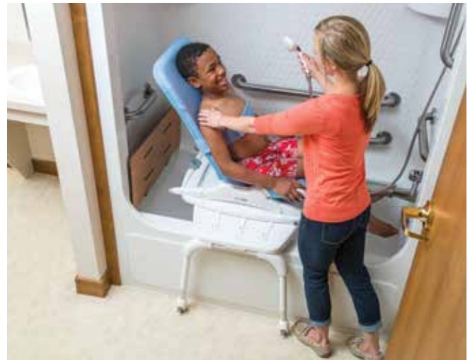
4. In the final position the bath chair is over the tub, and can be adjusted as desired before showering.