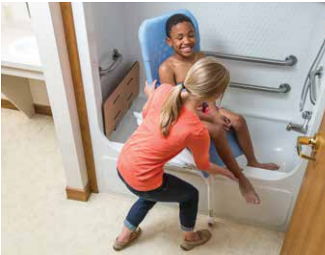
3. As the bath chair rotates, it continues to move back over the tub. Gently lift the client's legs to clear the edge of the tub.