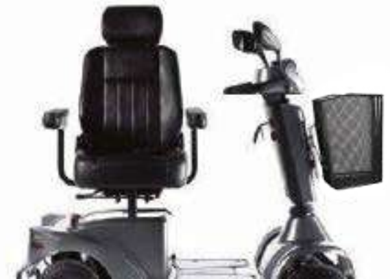
→ Seat rotation enables comfortable transfers