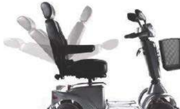
→ Quick backrest angle adjustment