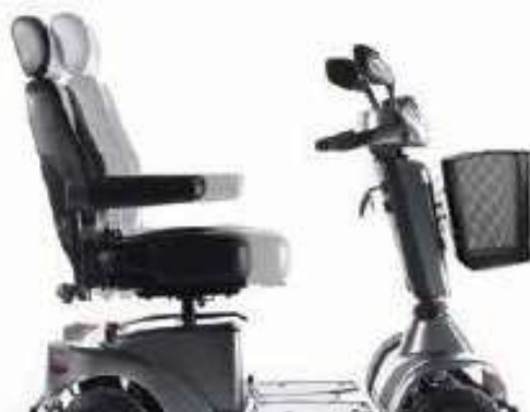
→ Infinite seat depth adjustment