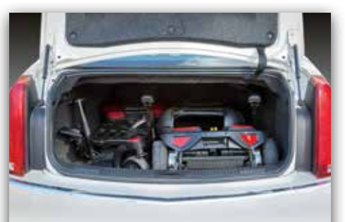
Transport Feather-touch disassembly for easy, lightweight travel options.

Storage Dual, swing-away under seat compartments for convenient storage of personal items.