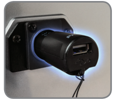
XLR USB charger