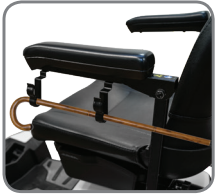
Cane clip attachment

A wide selection of Pride Mobility Scooter accessories are available to personalize your Pride Mobility Scooter to better meet your needs and make it uniquely yours.