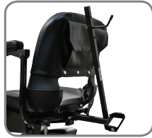
Wishbone crutch holder