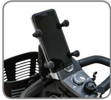
RAM® X-Grip® cell phone holder