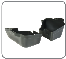
Under seat storage bins