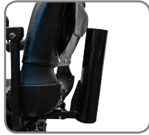
Single cane holder