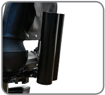
Double cane holder