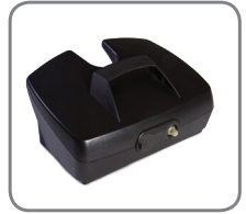
Additional battery box (12 amp)