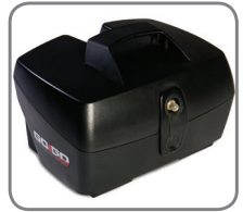
Additional battery box (18 amp)