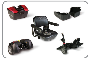
Go Chair® disassembly

Most Go-Go® Travel Mobility and Pride® mid-size scooters feature Feather-Touch —one-hand disassembly for hassle-free transport and storage.