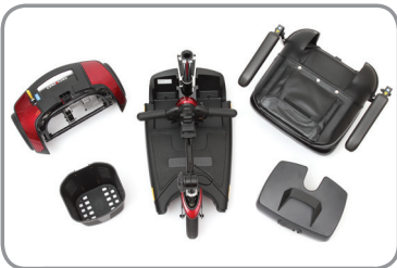
Scooter/travel mobility disassembly